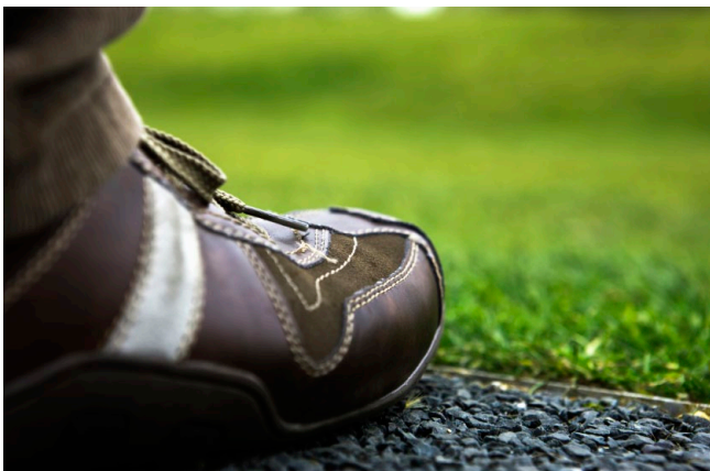
Pesticides on the lawn can be tracked in and make patients sick.